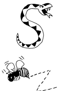
Figure 1. An example of pictures of sound personalities incorporating letter-shape association.

This is probably best done by associating phonemes with a creature, an action, or an object that is familiar to the child. For example, the phoneme /s/ can be associated with the hissing sound a snake makes – sssssss . A sound personality can be created by calling /s/ the "Sammy snake" sound. Many sounds have natural associations, such as a crowing rooster for /r/, a buzzing bee for /z/, and the "be quiet" sound for /sh/.